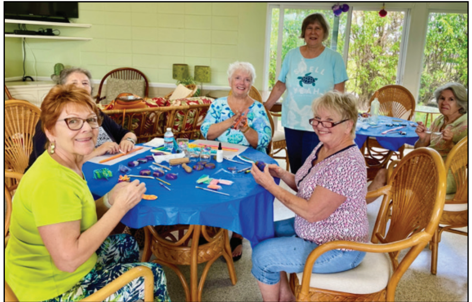
BBGC members making favors for District X Meeting

When the city recently updated the irrigation system at the downtown Community Garden we maintain, our gardeners were motivated to redesign the space as a Bird-Friendly Urban Oasis. Existing beds were enlarged, water features refurbished, and a Plant Donation Day requesting bird-friendly and pollinator-friendly plants, was posted on the calendar. The garden is already remarkably transformed. The work has not yet been completed, and the butterflies