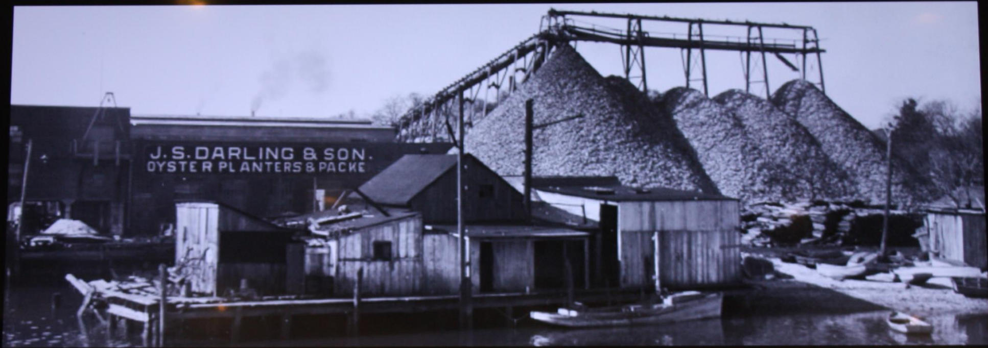
Norfolk Public Library