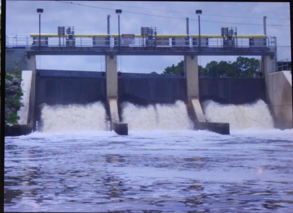
Anthropogenic control of freshwater inflow & freshwater pollution