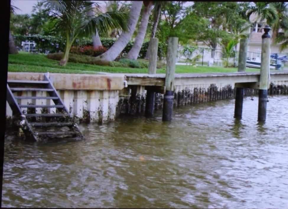
Direct loss of important natural habitats